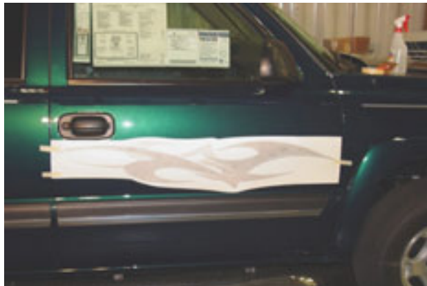
1. Tape the graphic onto the side of vehicle to determine exactly where you want the graphic installed.